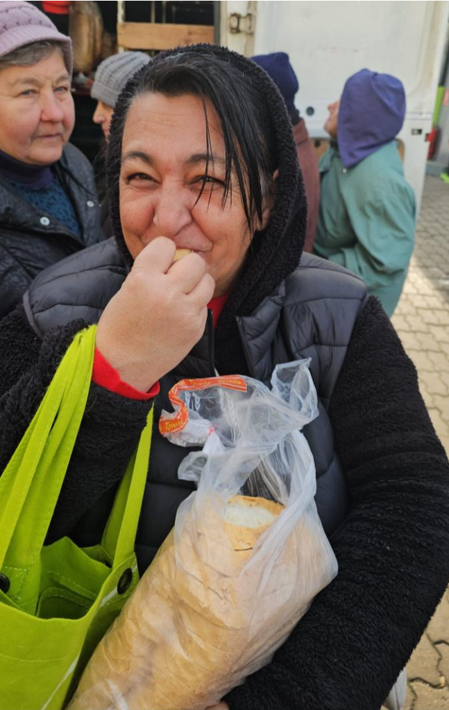
Bread distribution from mid December to end of March should cover the coldest winter months. Below: Most donated blankets were knitted only a few were crocheted.

Pictures from distributions in Romania - not just shoeboxes but reaching out with food and winter fuel and blankets. Some recipients were Ukrainian refugees now living in Romania.