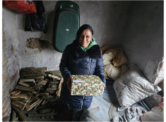
Firewood as well as a Christmas shoebox

Years ago we decided we wanted to try to prevent anyone who received a Christmas shoebox from us in December from either freezing or starving to death in January.